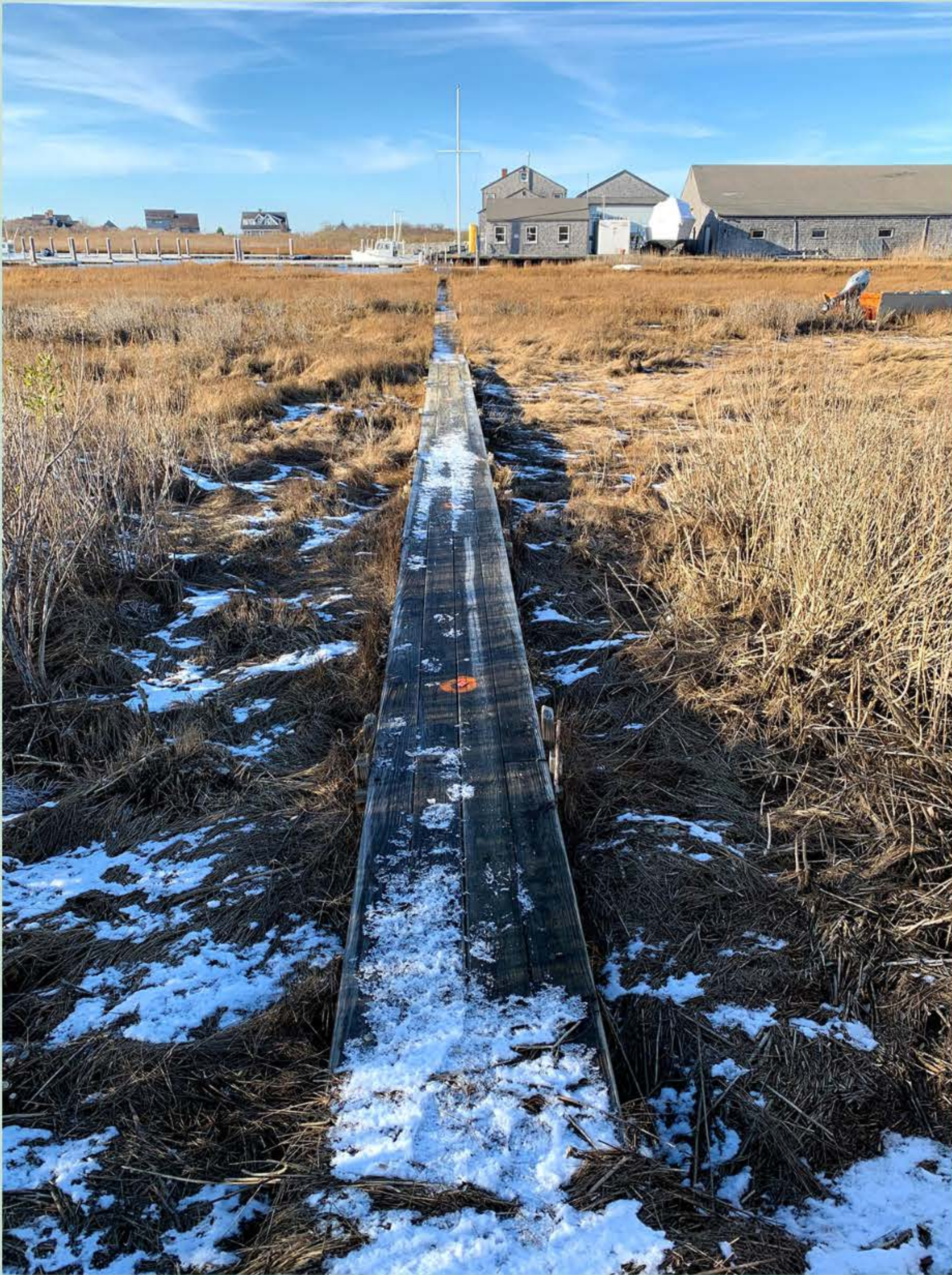
Old Chase dock, December 2019

This past January, our field crew was hard at work rebuilding a boardwalk and dock down at the Land Bank’s Chase property, located at 48 & 50 Tennessee Ave in Madaket.