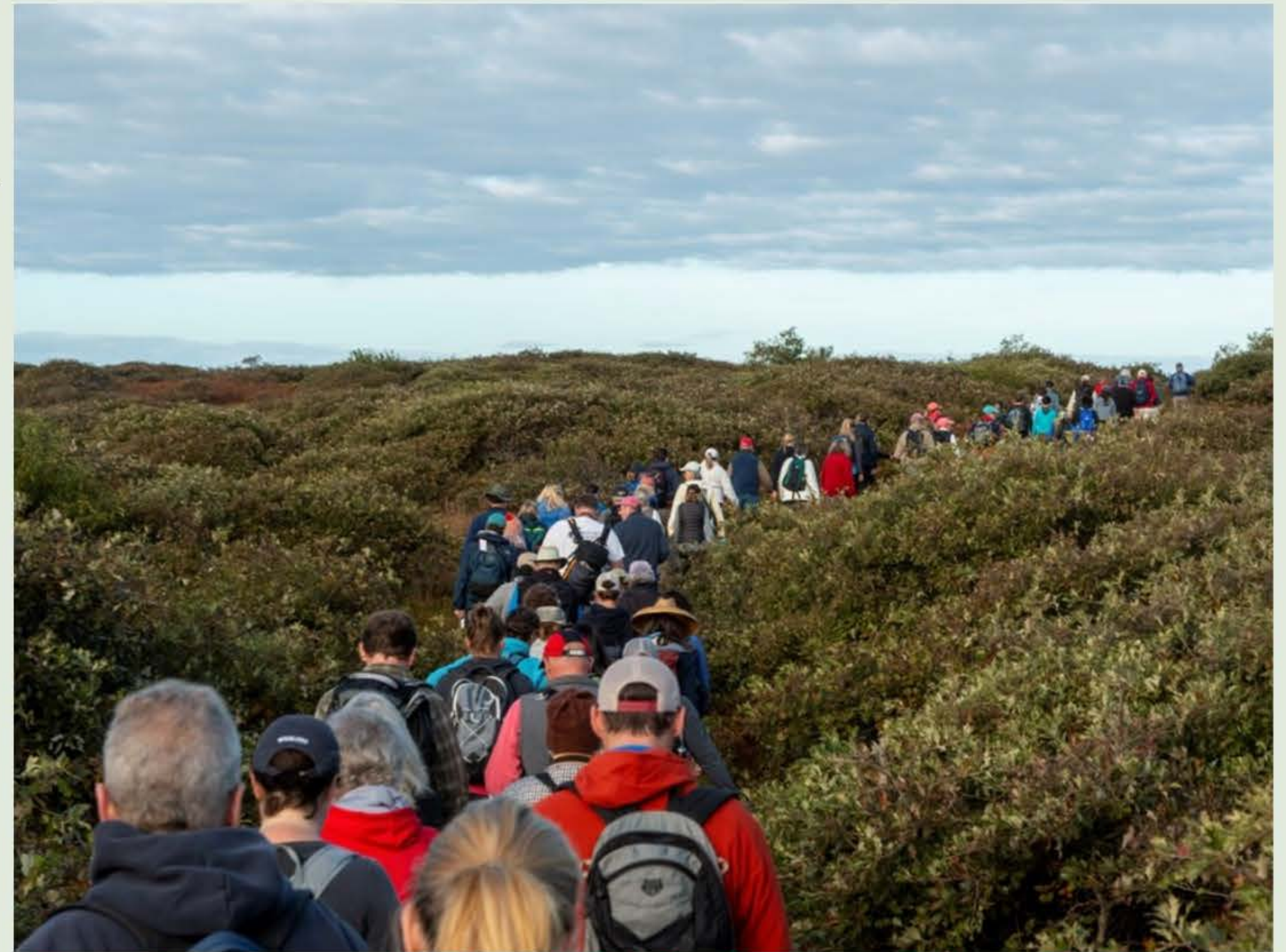
Beginning of the 2019 Cross Island Hike.

After seeing the enthusiasm for this event, the Land Bank began working on a collaborative project to establish a permanent trail that traverses the island, which will be known as the Coast to Coast Trail. Working closely with our partners, Massachusetts Audubon Society and the Nantucket Conservation Foundation (NCF), we have created a tentative route for the trail, beginning in Sconset and ending in Madaket.