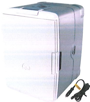
Igloo 40-quart Electric Cooler