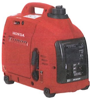
Honda EU1000i Portable Inverter Generator