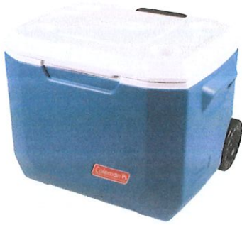
Coleman 50Q Wheeled Cooler