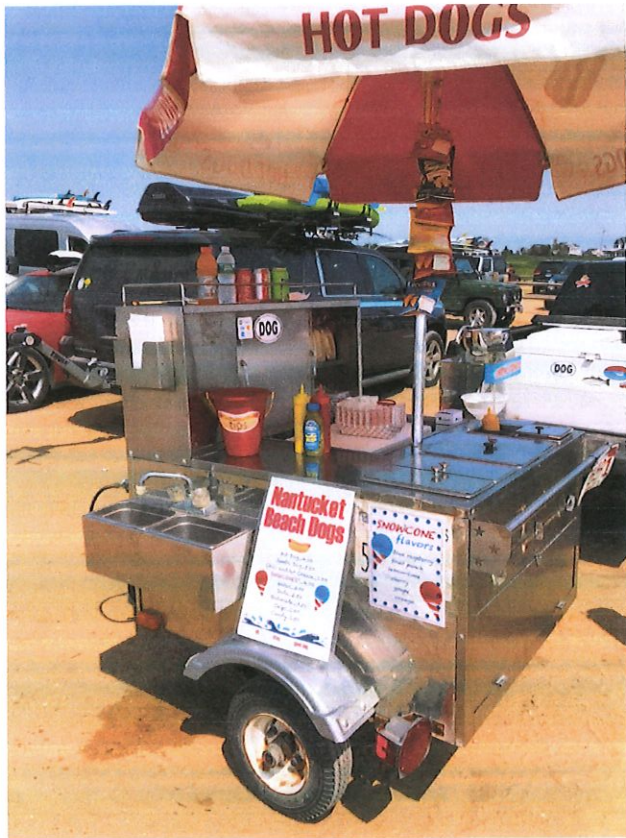
All American Hot Dog Cart